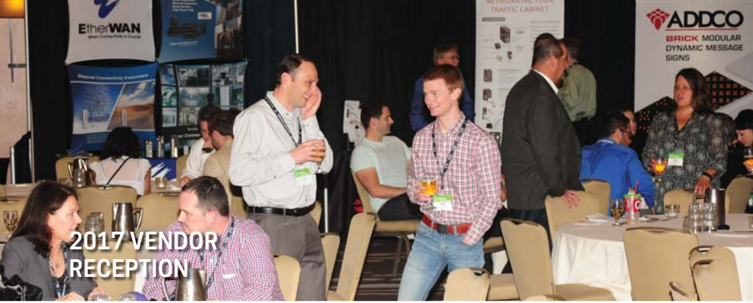
2017 VENDOR RECEPTION